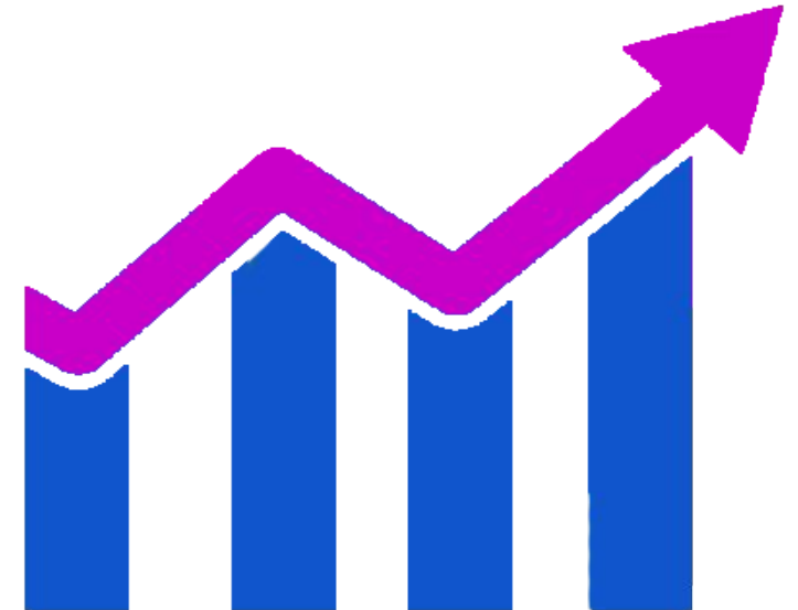
Adoption of Blockchain Increases